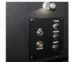
Headset jacks and instructor controls