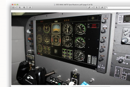
Intuitive panel layout

You have over 30 aircraft available and many choices of panel layouts and navigation aids to select from. Be better prepared to use the tools in your aircraft before you have to know how to use them in an emergency.