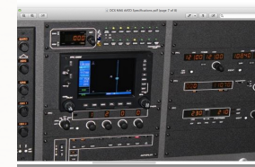
Garmin 530W, KAP 150 autopilot

Features also include the KAP 150 autopilot, KAS 297B vertical speed with altitude preselect, fight director and Garmin 530W found in many aircraft. Learn more about the advanced operation of the Garmin 530W and KAP 150 autopilot in 30 minutes in the DCX MAX rather than hours in a plane.