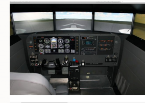
5-monitors 225 degree Panoramic visual system

The DCX MAX utilizes five 42" monitors providing a 225 degree wrap around visual display incorporating a world wide Jeppesen database that allows for flying any instrument approach in the US including WAAS approaches