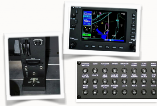
Garmin 530W, functional circuit breaker panel, center control console

The Precision Flight Instrument DCX MAX is a fully enclosed FAA Advanced Aviation Training Device (AATD) that can simulate a host of systems failures and a multitude of weather conditions. By being prepared for these situations, you'll be more confident in your abilities in the air should you ever encounter a true emergency. The system is also compatible with ForeFlight, allowing you to monitor your flight path on your iPad just as you do in the actual conditions. The ability to "freeze" the flight at any point to discuss key points, review the use of the 530W, or autopilot coupling of the approach provides for a superior learning platform.