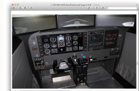
Ergonomic cockpit layout