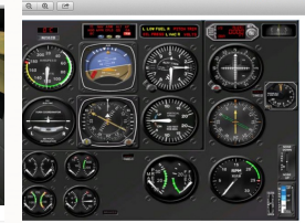
Hi-resolution instrument panels